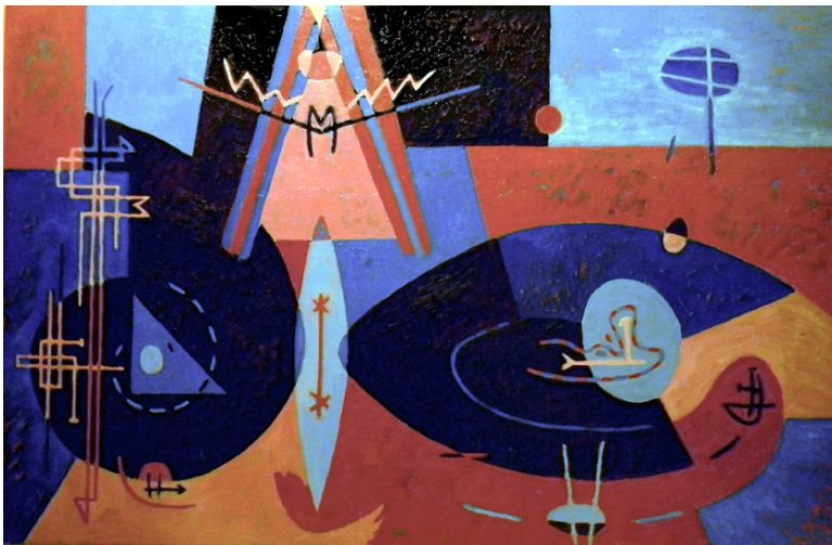
Figure 11: Gordon Onslow Ford Pyramid of the Falcon, 1949, oil on canvas