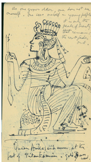
Figure 1: Drawing from Notebook, 1963, ink on paper, Gordon Onslow Ford Archive, © The Lucid Art Foundation.