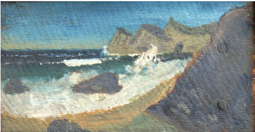
Figure 2: Gordon Onslow Ford Untitled, 1923, oil on wood, Gordon Onslow Ford Archive