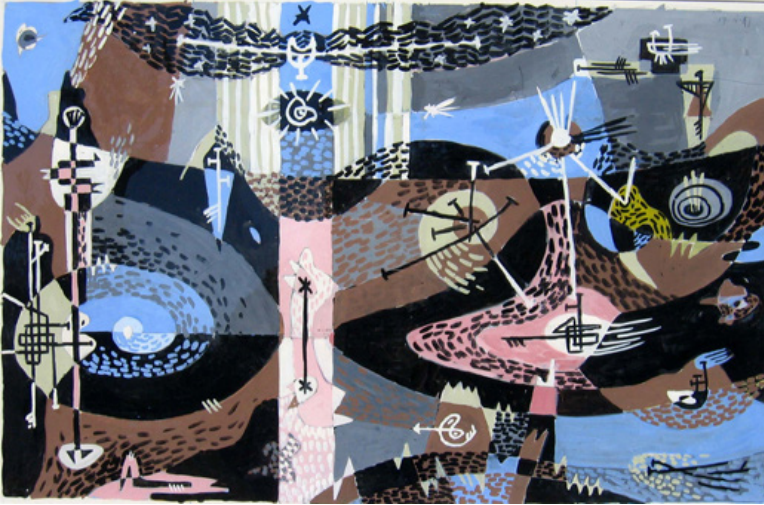
Figure 10: Gordon Onslow Ford Future of the Falcon, 1947, casein on paper