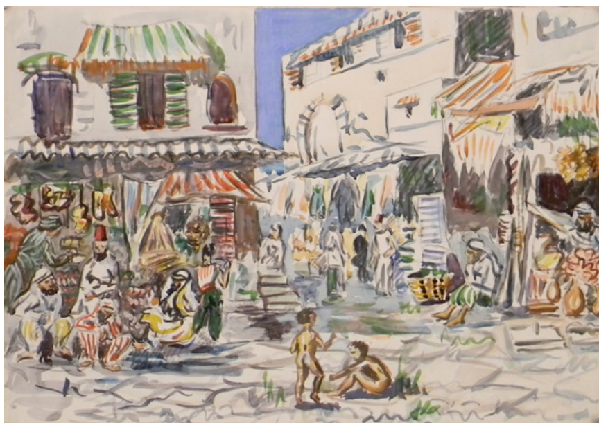
Figure 5: Gordon Onslow Ford Egypt , circa 1936, watercolor, crayon on paper, Gordon Onslow Ford Archive, © The Lucid Art Foundation.

Alexandria is huge. It takes over an hour to get into the town from the ship, but there is an opera and some good art shops. The town is new and dusty — great big blocks of cement and concrete with shuttered windows, columned awning, the canal is charming and there are some very fine gardens... There is something very exciting in the air full of the most wonderful possibilities.