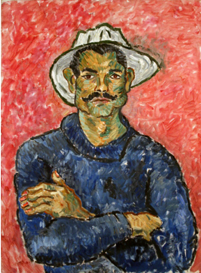
Figure 8: Gordon Onslow Ford The Gardner: Fellaheen , 1937, oil on canvas, Gordon Onslow Ford Archive, © The Lucid Art Foundation.