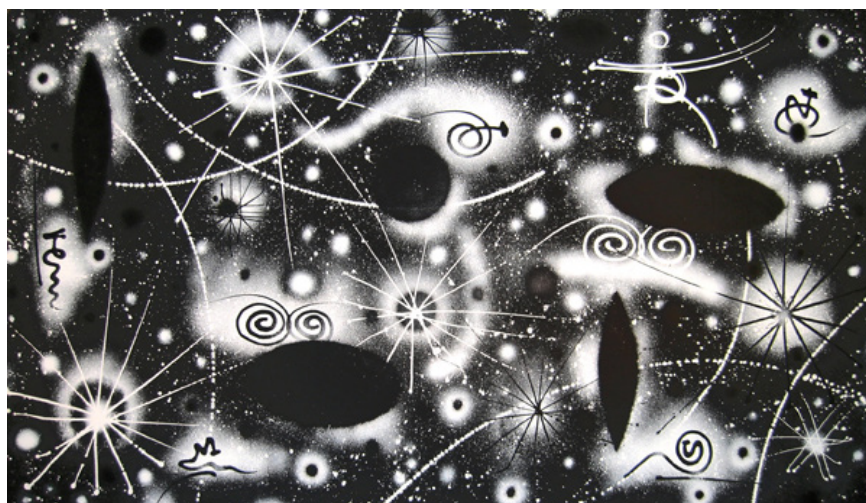
Figure 15: Gordon Onslow Ford All One's Company , 1993, acrylic on canvas, Gordon Onslow Ford Archive, © The Lucid Art Foundation.

Onslow Ford played as a child. The oval shape he created in the late 1930s continued to appear in his later paintings, but was transformed into clusters of images of a black void before his death in 2003.