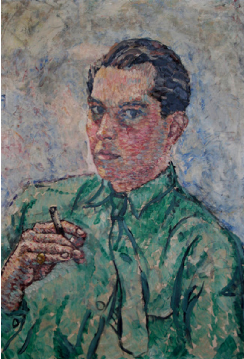
Figure 3: Gordon Onslow Ford Self Portrait, circa 1932, oil on canvas, Gordon Onslow Ford Archive

uncle, who served in the army, decided that Gordon's career would be in the British Navy. He was sent to the Naval College at Dartmouth, Devon to prepare to be an officer.