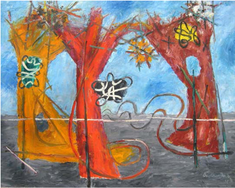
Figure 9: Gordon Onslow Ford 3 Trees Move Along, 1938, oil on canvas, Gordon Onslow Ford Archive

Tutankhamun's tomb to see beyond the horizon of his limited perception of reality? In an interview in 1999, Matta mentions, "Gordon had to give up his trees to become a surrealist."