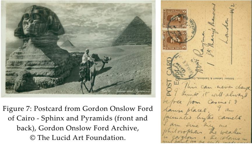
Figure 7: Postcard from Gordon Onslow Ford of Cairo - Sphinx and Pyramids (front and back)