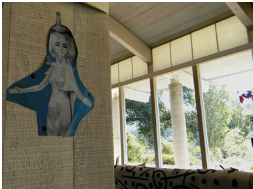
Figure 14: From Gordon Onslow Ford's home, 2012 Isis , date unknown, magazine clipping, Gordon Onslow Ford Archive, © The Lucid Art Foundation.

with Onslow Ford's cosmology is Lady of Heaven or Lady of the Sky . In one of his favorite Egyptian books on Tutankhamen, he has marked on the page with images of the Isis. "The last magical gestures by the new king Ay over the mummy permitted the Osiris, Tutankhamen, to enter the other world where he was received by the "Lady of the Sky, Nut, mistress of the gods", who offered him a libation" (Desroches-Noblecourt 246). There are many renditions of Isis, but the image Onslow Ford chose to display on the wall of his home was the one of Isis depicted on King Tutankhamun's sarcophagus.