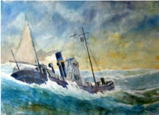
Figure 4: Gordon Onslow Ford Drifter, 1931, watercolor on paper